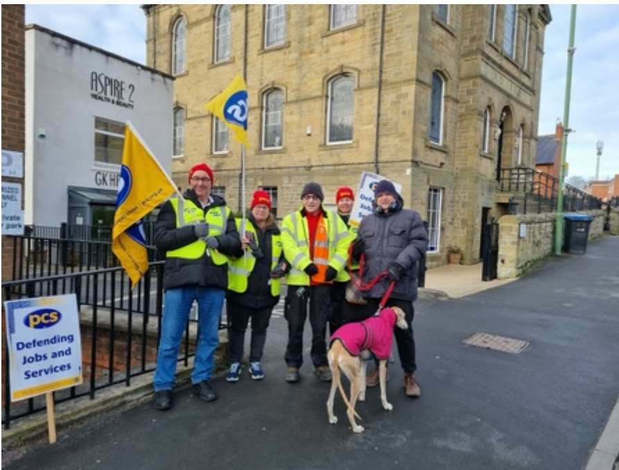
ne in Cardiff

At DWP Durham we have another #picketlinepooch and the postal worker who refused to cross the picket line and sends solidarity.